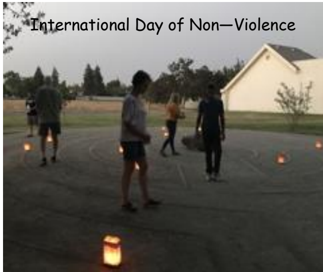
International Day of Non—Violence

Continuing the work of Jesus. Peacefully. Simply. Together.