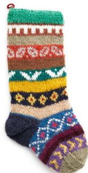
Some samples of SERRV Christmas items: