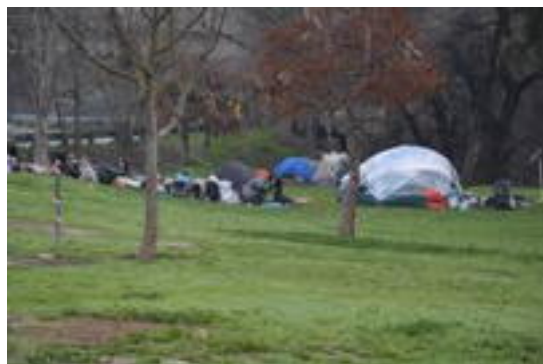
Homeless camping in Beard Brook Park